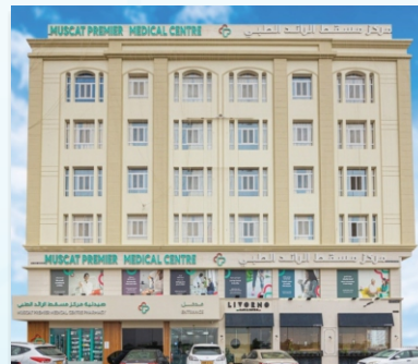
MUSCAT PREMIER MEDICAL CENTRE Oman