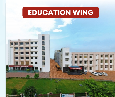
METRO COLLEGE OF HEALTH SCIENCES & RESEARCH , Greater Noida