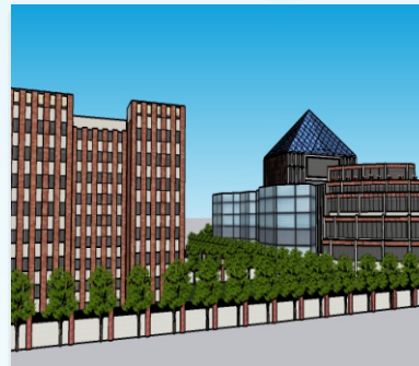
METRO UNIVERSITY Greater Noida, UP