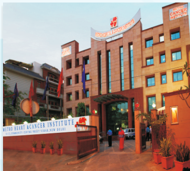
METRO HOSPITAL & CANCER INSTITUTE Preet Vihar, Delhi