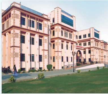
METRO MAS HOSPITAL Jaipur