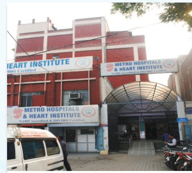
METRO HOSPITAL & HEART INSTITUTE Meerut