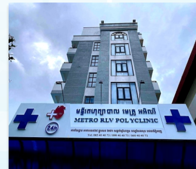
METRO RLV POLYCLINIC , Phnom Penh, Cambodia