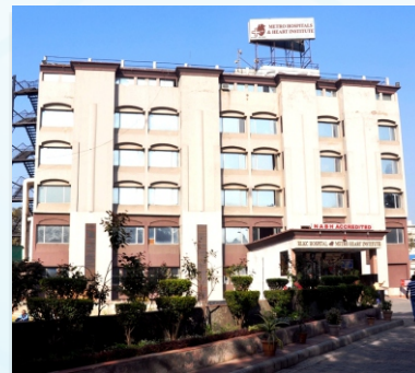
METRO RLKC HOSPITAL & HEART INSTITUTE, Pandav Nagar, Delhi