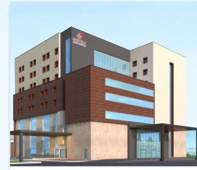
METRO CANCER INSTITUTE Faridabad