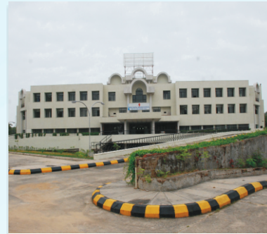
METRO HOSPITAL & RESEARCH INSTITUTE , Vadodra