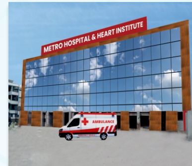
METRO HOSPITALS & HEART INSTITUTE , Moga, Punjab