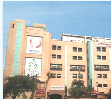
METRO HOSPITALS & HEART INSTITUTE Sector-11, Noida