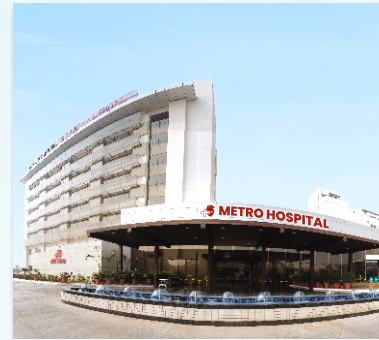
METRO HEART INSTITUTE WITH MULTISPECIALITY, Faridabad