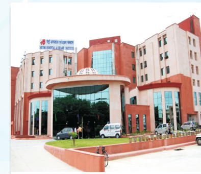
METRO HOSPITAL & HEART INSTITUTE Haridwar