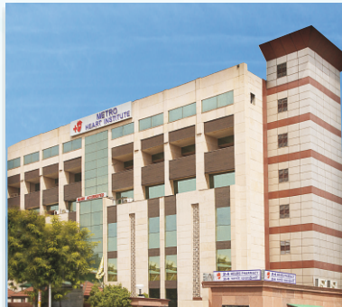
METRO HOSPITALS & HEART INSTITUTE Sector-12, Noida

Experience the highest standards of medical care with Metro Group of Hospitals