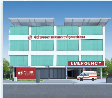
METRO UMKAL HOSPITAL & HEART INSTITUTE , Rewari