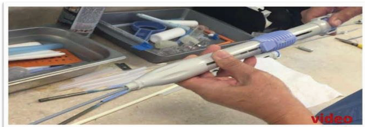
Venibri Aortic Valve, Pre-crimped and ready to be implanted